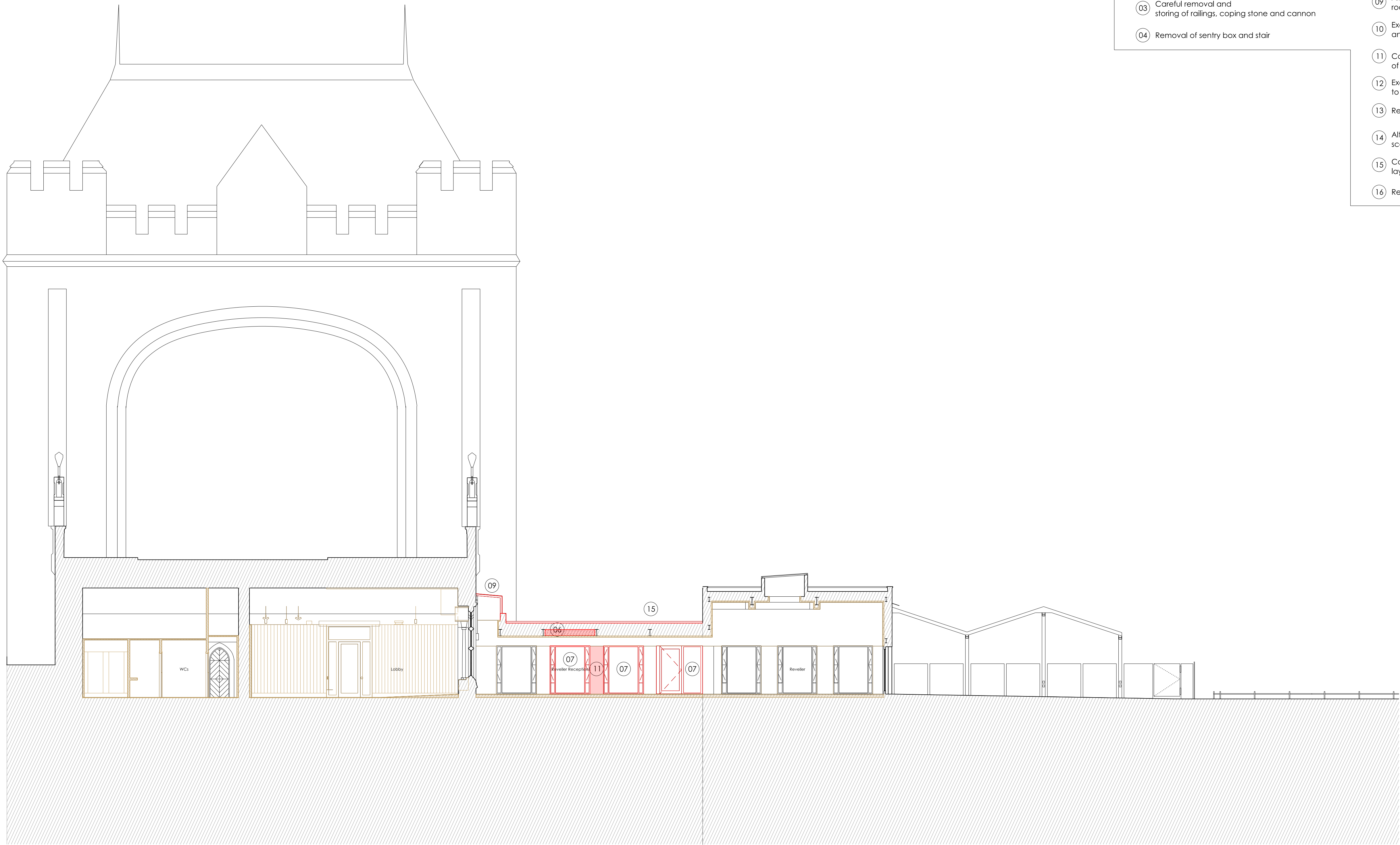
01 0140 Section AA Demolition

To be read in conjunction with Heritage Architects information. For conservation repair works refer to Heritage Architects information.